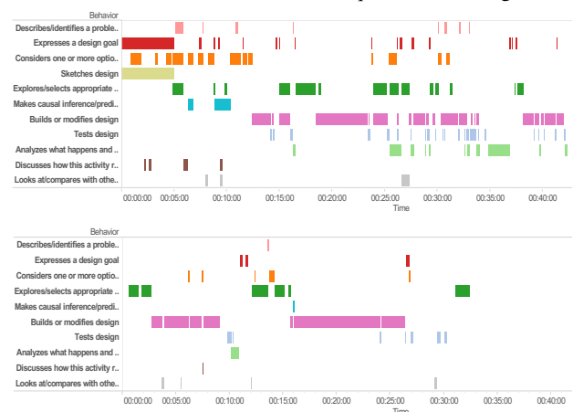
Figure 2. Sample visitor design process timelines for Engineer the World (top) and Sound Engineering (bottom).

The cross-community design process presents a novel and sustainable way to incorporate real-world engineering with making. The design teams developed implicit and explicit criteria that guided the design of their tinkering challenges to engage visitors in a mutual learning experience, rather than a one-way communication [7,12,18]. As a consequence, the design teams