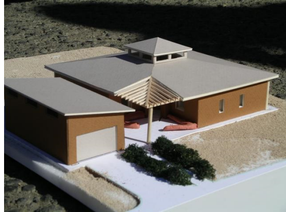
Figure 1: FINAL ROUNDHOUSE PROTOTYPE DESIGN.

Due to the crisis in supply for Native American housing, tribes across the country are seeking to build more sustainable, and affordable, housing stock. Since the passage of the Native American Housing Assistance and Self-Determination Act (NAHASDA) in 1996, Tribes have been given